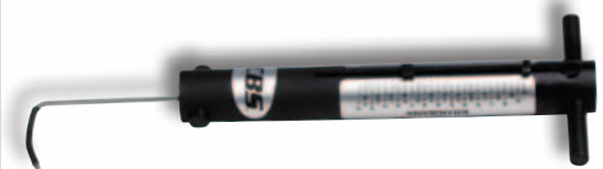
Military Trigger Pull Scale