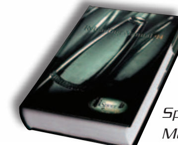
Speer Reloading Manual #14