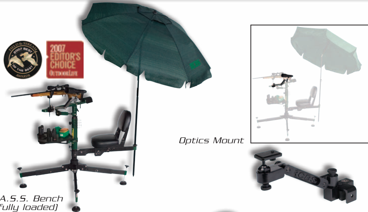
R.A.S.S. Bench (fully loaded)