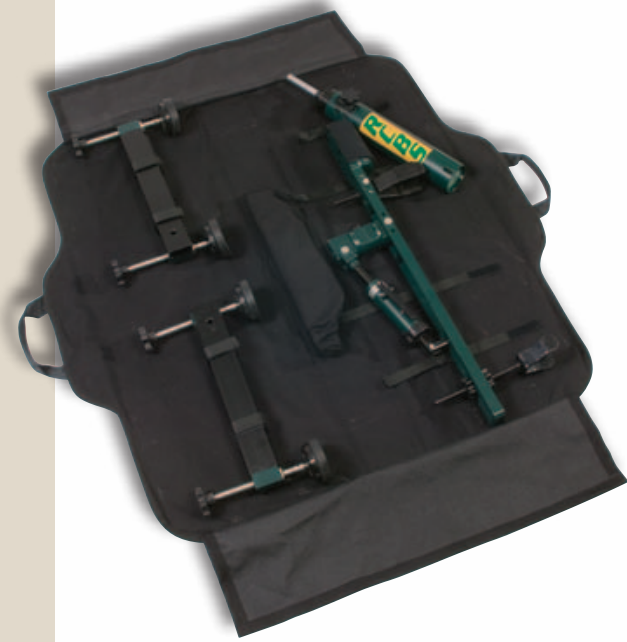
R.A.S.S. Transport Bag (open)

9325 Transport/Storage Bag (2-pc. soft bag) $169.95