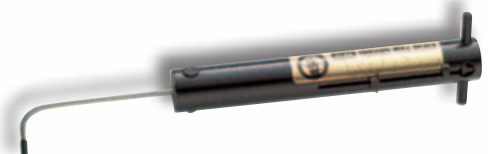
Premium Trigger Pull Scale