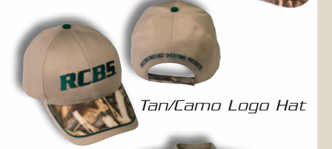
Tan/Camo Logo Hat