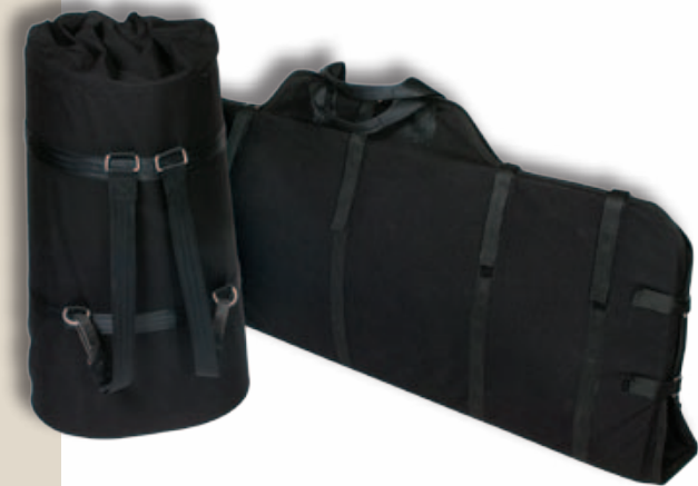
R.A.S.S. Transport Bags (closed)