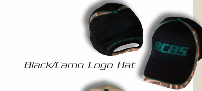
Black/Camo Logo Hat