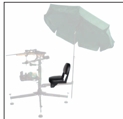
Low Back Seat