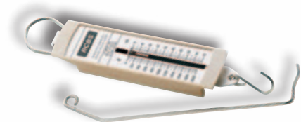
Trigger Pull Gauge